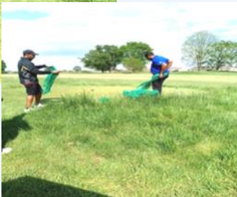
We do want to know more about the team in the grass skirts.

It was a great day for the first Annual Bardstown Main Street golf tournament on Friday. This is a new fundraising event for them and a good time was had by all!!