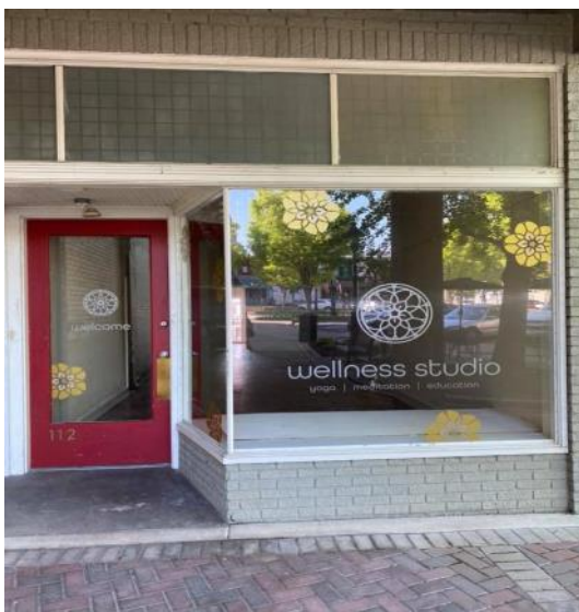
Another new business in the Heart of Scottsville Scottsville Counseling Center will be opening a Wellness Studio at 112 East Public Square. They will be offering yoga, meditation, & education in their new space!